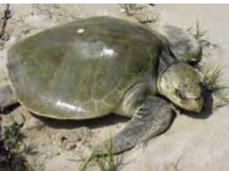
A Kemp's Ridley sea turtle on a nesting beach.

chronicle of the recent history of a very unique and Critically Endangered species. As we collaborate to pursue our common goals in sea turtle research and conservation, we can replicate this result for all species. Today, the type of collaboration that has begun to bring back the Kemp's Ridley from the brink of extinction is extraordinary, but tomorrow it will be the norm.