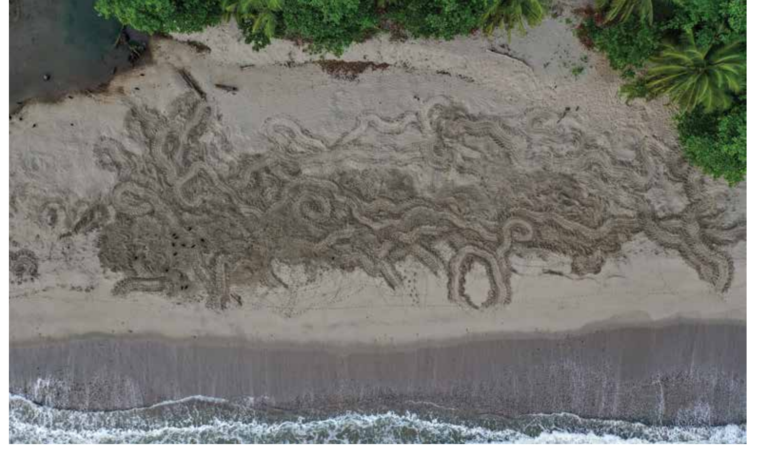
An aerial photo taken with a drone shows the tracks of leatherback turtles that emerged in Grande Riviere, Trinidad, the night before. Drones are giving field biologists new ways collect sea turtle data. AT LEFT: Drones can be outfitted with thermal imaging accessories to capture nighttime imagery such as this thermal image of a turtle returning to the sea after nesting.

Other exciting innovations that have come about recently include the use of fluid lensing , an experimental algorithm that uses light wavelengths that transmit through water to analyze submarine structures and thereby create detailed underwater maps that are accurate to within a centimeter. The principle is the same as in the