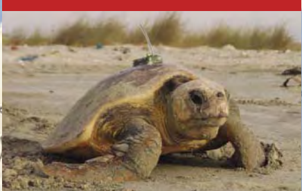
After being fitted with a satellite transmitter, this loggerhead turtle leaves Masirah Island in Oman. Tracking studies such as these help scientists determine the location of feeding grounds and understand the global nature of sea turtles.