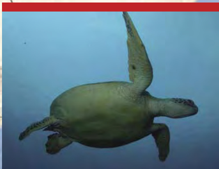
A green turtle swims near the Socotra Islands of Yemen. Although the turtles are not known to nest on the islands, they are frequent visitors to the local waters.

Among the Middle East's many fascinating inhabitants are the thousands of sea turtles that roam the region's waters, feeding on a plethora of marine delicacies and arriving each year, with unfailing regularity, to nest on the region's shores. The Arabian Peninsula dominates the region: its beaches are washed by the Red Sea to the west; the Gulf of Aden and the Arabian Seas to the south and east, respectively; and the Arabian (Persian) Gulf in the northeast. Each of these marine bodies hosts a kaleidoscope of unique fauna—including globally important sea turtle populations—and each population has its own conservation challenges.