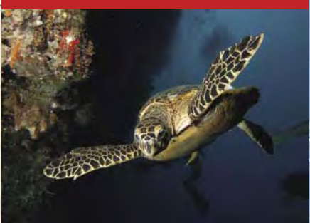
A hawksbill turtle swims among the corals of Sudan's Suakin Archipelago. Hawksbills often nest on remote islands in low densities, helping them to avoid predation.