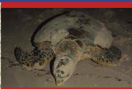
Following a long nesting outing on one of Qatar's beaches, this hawksbill retires to the sea. Most hawksbills in the Arabian Gulf lay between one and three clutches in a nesting season. Industrial development from the oil and natural gas industry threatens most nesting habitats for turtles in the region.