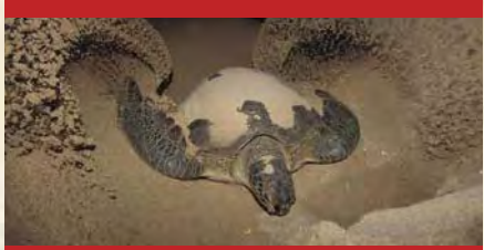
A green turtle nests on Saudi Arabia's Karan Island in the Arabian Gulf. More than 1,000 turtles nest on this small 2-kilometer (1.24-mile) island each season. With mice as the only natural predators of their eggs, turtle populations have flourished, but an increase in foreign fishers on the islands has brought the threat of poaching.