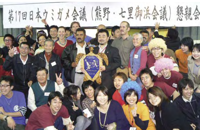
Sign reads, "17th Japan Sea Turtle Symposium Social Gathering." In Nov. 2006, fishermen, researchers, and resource managers from Mexico, Japan, and the United States gathered to commemorate the 10th anniversary of Adelita's track from Baja California Sur to Japan—the first loggerhead sea turtle to provide physical proof of their trans-Pacific migration via satellite telemetry. The objective of the trip was to share experiences, raise awareness and work toward reducing bycatch of loggerhead sea turtles during a two-week journey throughout the Japan Archipelago.