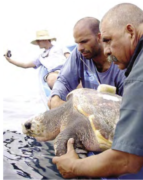
Fishermen from Puerto López Mateos, Baja California Sur, satellite track a loggerhead on her trans-Pacific journey.