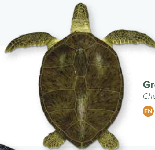
Green Chelonia mydas