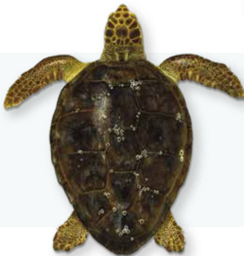
Loggerhead Caretta caretta