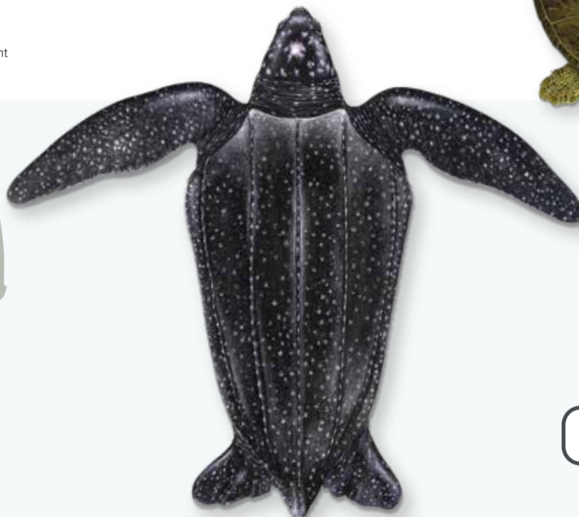
Leatherback Dermochelys coriacea