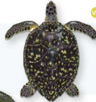
Hawksbill Eretmochelys imbricata