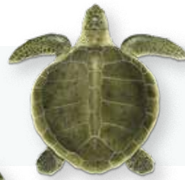
Kemp's ridley Lepidochelys kempii

The seven sea turtle species that grace our oceans belong to an evolutionary lineage that dates back at least 110 million years. Sea turtles fall into two main subgroups: (a) the unique family Dermochelyidae , which consists of a single species, the leatherback, and (b) the family Cheloniidae , which comprises the six species of hard-shelled sea turtles.