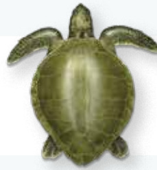
Olive ridley Lepidochelys olivacea