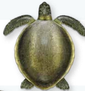
Flatback Natator depressus