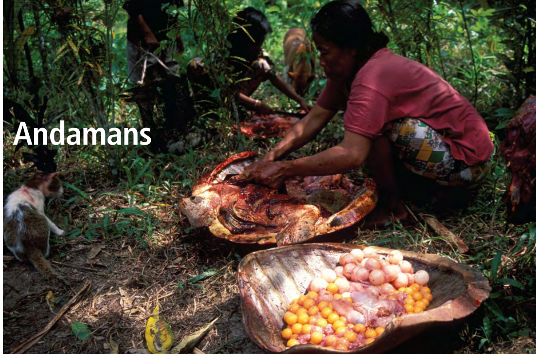
Consumption of sea turtles is not uncommon among peoples of the Andaman Sea. Here, Nicobari villagers from Chingen on Great Nicobar Island prepare a green turtle for eating.

There are many other threats to sea turtles in the area, such as ghost fishing nets, poaching, and beach loss attributable to sand mining—most of these brought on by recent settlers or by changes in traditional